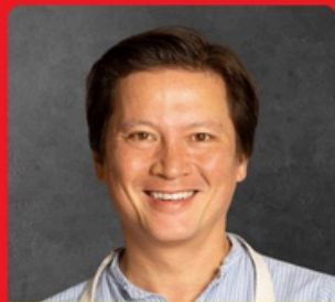
J. KENJI LÓPEZ-ALT November 18, 2025